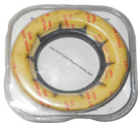
ZPS-WHT-1401 WAX SEAL FOR S TRAP MB/CC WC